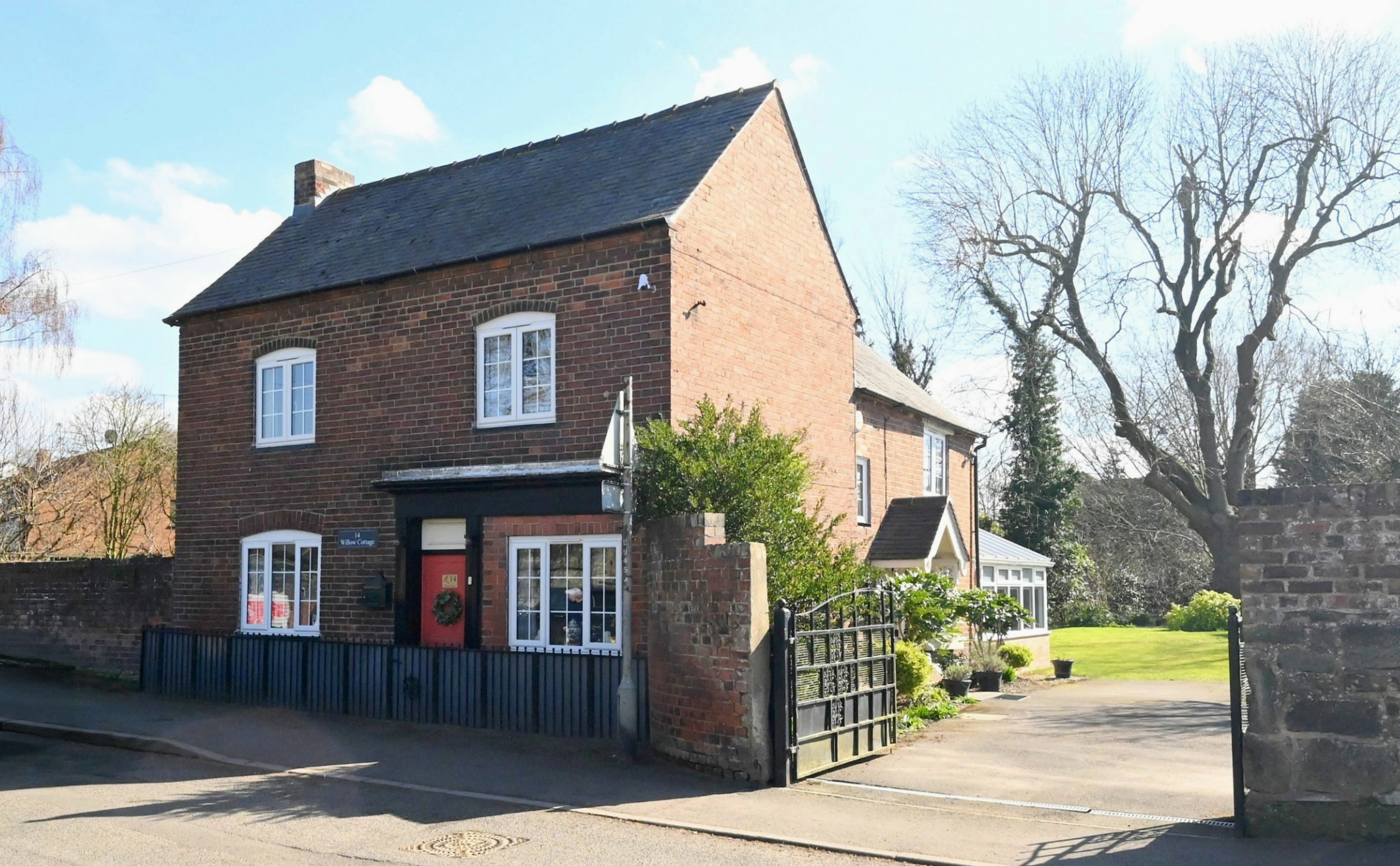
Willow Cottage, 14 Brook End, Repton, DE65 6FD