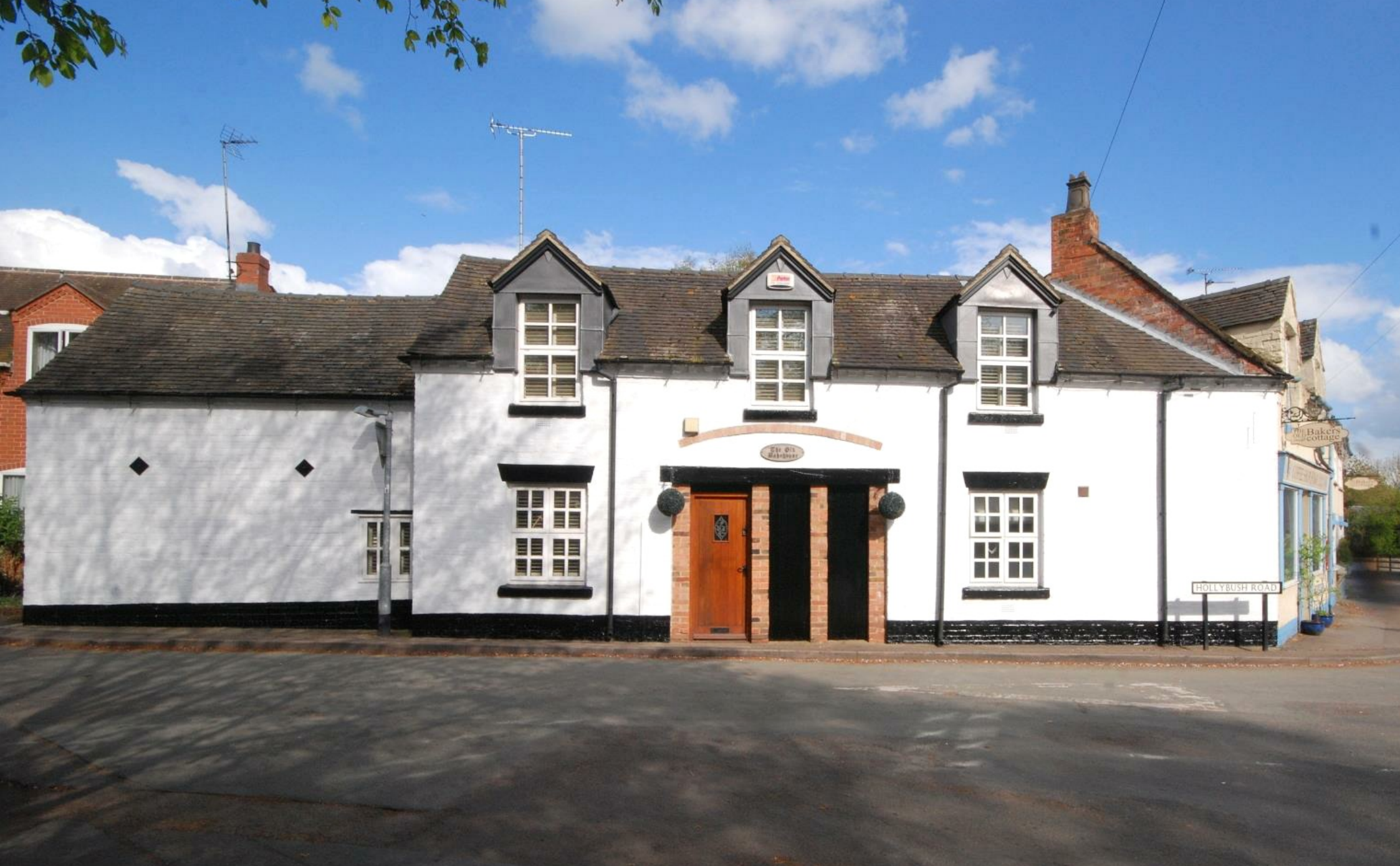
The Old Bakehouse, Hollybush Road, Newborough, DE13 8SF